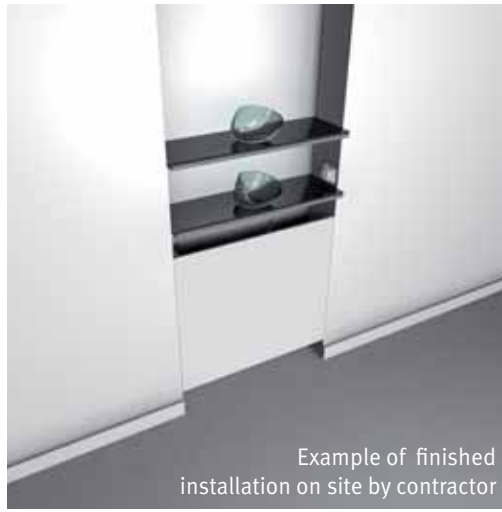
Example of finished installation on site by contractor

BUILD-IN WALL Installation into a wall recess