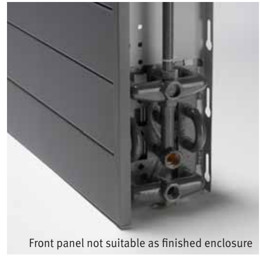
Front panel not suitable as finished enclosure