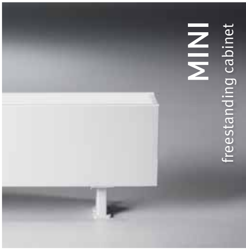
MINI freestanding cabinet