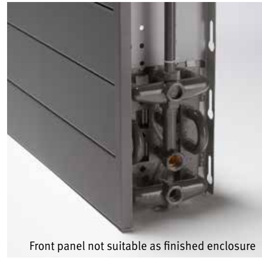
Front panel not suitable as finished enclosure